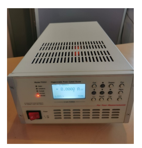
Fig.3. Programmable Controlled Power Supply DX-F2031 for the electromagnet.

The resolution of the power supply is 0.1 mA. It must be checked so that the accuracy of the result is ensured. The accuracy of the power supply is 0.2 %. It is the ground for the tolerance \Delta out calculation. Stability of the power supply is 0.1 %@10A. The resulting stability depends on the whole stabilizer. The magnet should provide a sufficiently homogeneous static magnetic field allowing utilization of the NMR technique. The control arrangement should organize the whole operation of the stabilizer, besides others, the sampling interval should be produced. Its inaccuracy is another significant source of the tolerances. All the considered sources of the tolerances are assumed as accuracies, though in practice they are also precisions.