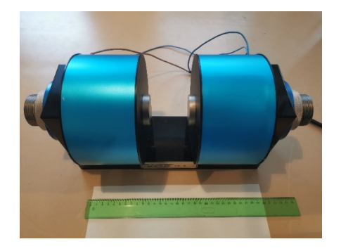
Fig.2. Electromagnet DXWD-50.