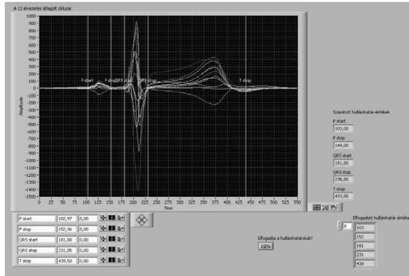
Fig. 1. Interactive marker-adjustment software

In this manner this study shows the “best-case” results. It means that our throughputs will provide the lower-bounds.